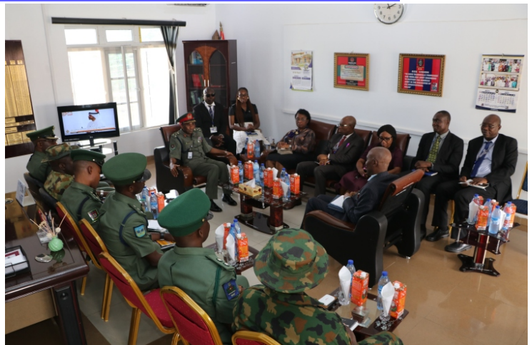
Cross-section during the courtesy visit to the Nigerian Army Engineer Construction Command, Ede.