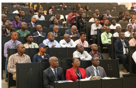
Cross-section of participants at the Special Academic Staff Workshop

To conclude his presentation, he also mentioned the commitment of the management is to provide incentives; N250,000.00 per published high-impact paper that is indexed in Scopus and Web of Science to support and motivate researchers. The management would also promote staff that meets the promotion criteria. He mentioned that the academic staff also has a role to play in the actualization of this laudable goal of international pre-eminence. The Vice-Chancellor advised staff to Key into the Vison 2023 and contribute to the attainment of 600 Scopus-indexed articles by December 2022 by publishing a minimum of 2 articles per staff.