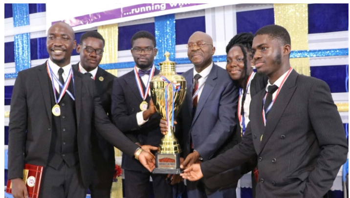
Provost, College of Postgraduate Studies, Prof. Ahmed Yerima (third from the right) while presenting the trophy to the winner (Faculty of Law) at the 3rd Redeemer's University Inter-Faculty Debate Competition held on the campus recently.