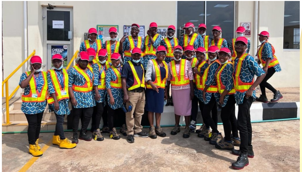
Final Year Nursing students during their visit to International Breweries, Ilesa