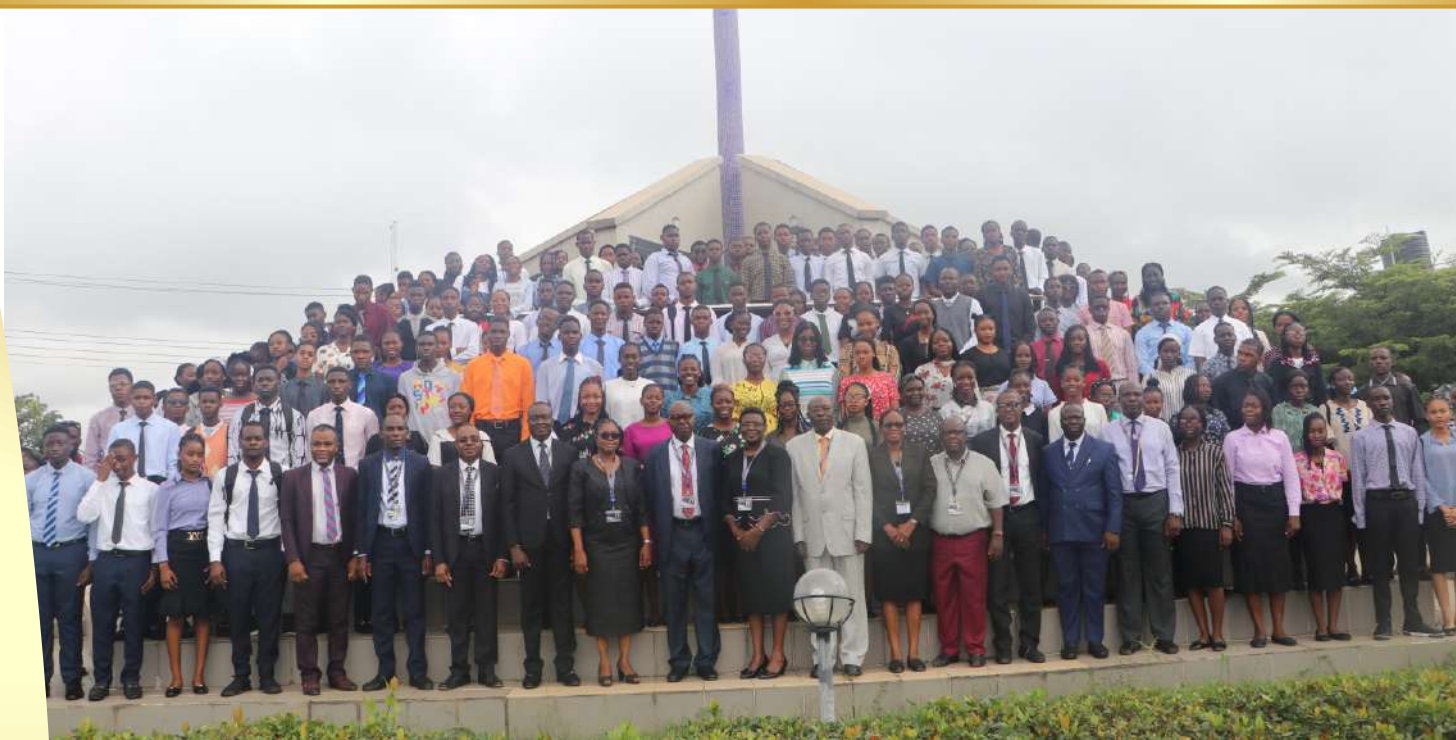
New students intake for 2023/2024 academic session and the senior members of the university during orientation programme organised by the university.