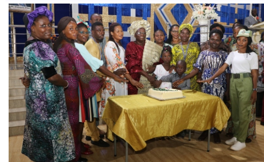
A cross section of December 2023 Celebrants