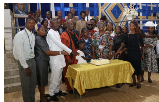
A cross section of January 2024 Celebrants